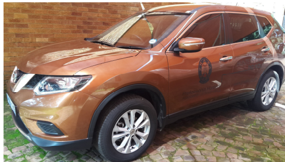
PHASA VEHICLE FOR SALE

The PHASA vehicle is for sale and we are giving our members a chance to make an offer.