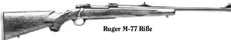
Ruger M-77 Rifle

The trigger overtravel adjustment set screw (shown on right) in a few of these rifles may not be securely tightened and may move too readily. This change in original adjustment can, in extreme cases, either cause the rifle to fire unexpectedly (with the safety "off") or cause the rifle to not fire at all. This may occur suddenly, without warning.