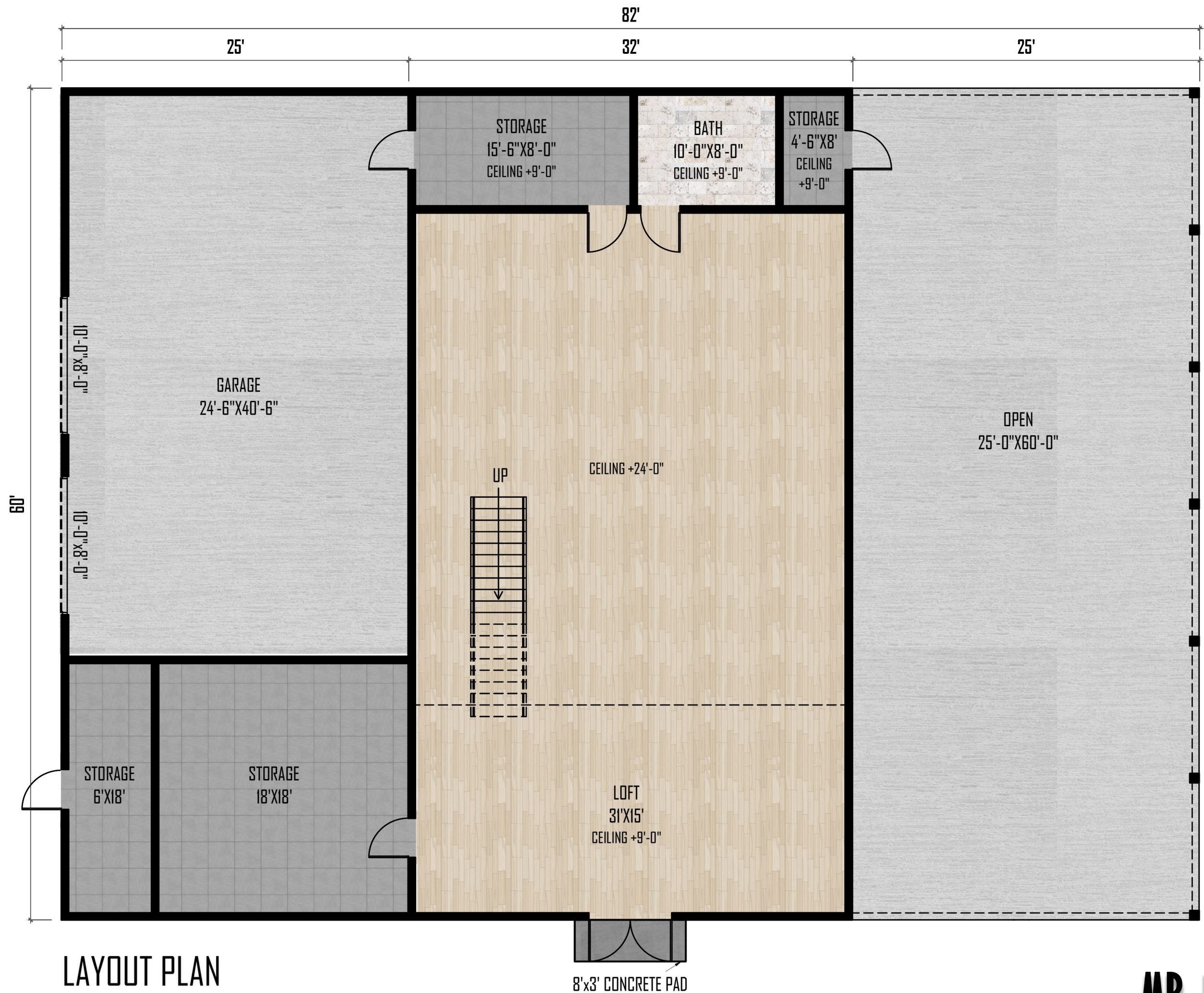
LAYOUT PLAN COVERED AREA = 4,920 SFT