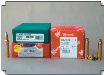
Reloading dies are available from Hornady and RCBS, while Hornady also offers .375 Ruger cases to handloaders.

When firing several hundred rounds over a chronograph, the .375 Ruger proved its excellent design by producing low extreme spreads. For example, the 270-grain Hor-