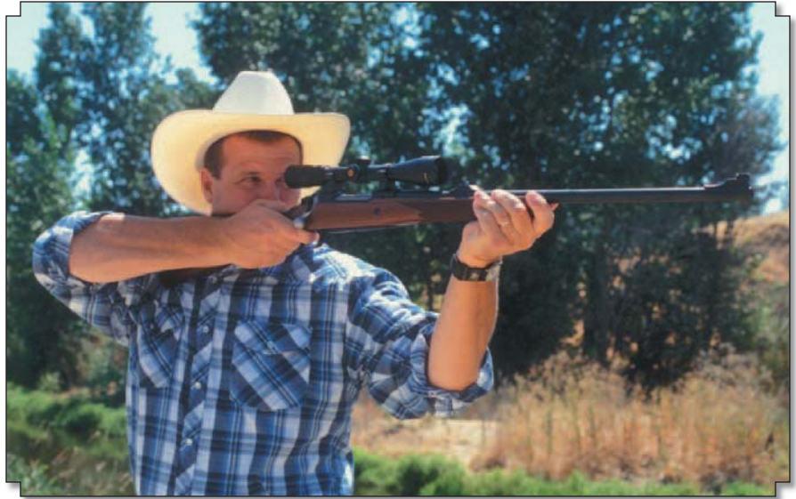
The new Ruger Model 77 Hawkeye African rifle weighs less than 7½ pounds (without scope) and should prove an excellent rifle for field use. It has great handling characteristics.

Handloading the .375 Ruger is straightforward. Be certain to adjust the sizing die to avoid pushing the 30-degree shoulder and “working” cases just forward of the head, which will lead to premature case separation. And keep cases trimmed within 2.580 inches to assure proper chambering. As previously stated the overall cartridge length is recom-