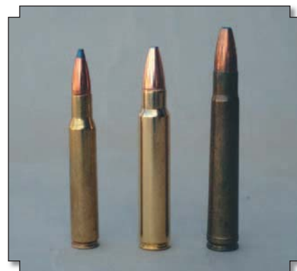
The .375 Ruger (middle) offers a slight performance edge over the .375 H&H Magnum (right) but has an overall cartridge length similar to a .30-06 (left).