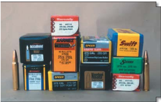
A variety of .375 bullets were used in the accompanying data.

None of the data in the accompanying table exceeded recommended industry pressure limits of 62,000 psi. All loads were developed using Hornady cases and capped with Federal 215 Large Rifle Magnum primers.