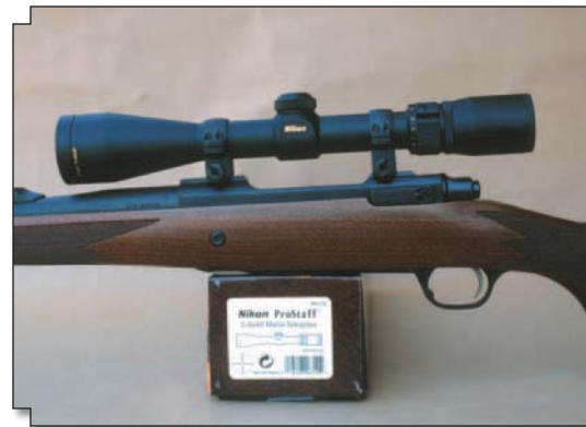
A Nikon variable 3-9x Prostaff scope was used to check loads for accuracy.

Be Alert – Publisher cannot accept responsibility for errors in published load data.