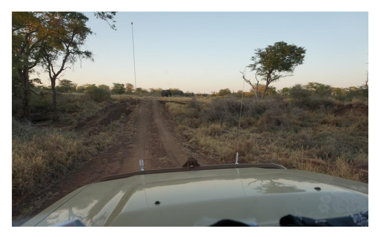
Elephant up ahead, a very common sighting.