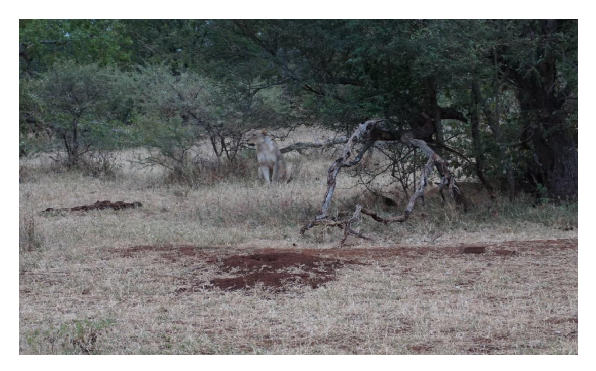
Another lion. Yes, there were lots of lions.